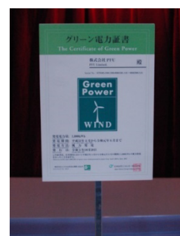
Notice of Green Power (PFU Christmas Charity Concert)

At the "PFU Christmas Charity Concert" (held in Kanazawa on December 11th), we contributed to spreading the use of natural energy in the nation and mitigating global warming by using renewable energy from wind power to supply the equipment in the venues with electricity.